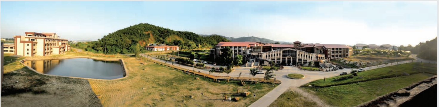
Panaromic view of the Academic Complex and the Computer and Communication Centre, IIT Guwahati