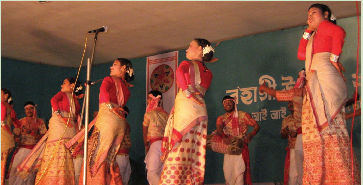
Husori performance during Bohagi Utsav 2010

Bihu is the biggest festival of the people of Assam and transcends all religious and class barriers bringing people together. The Assamese people observe three different types of Bihu during the year, each marking an agricultural activity and denoting a change of season.