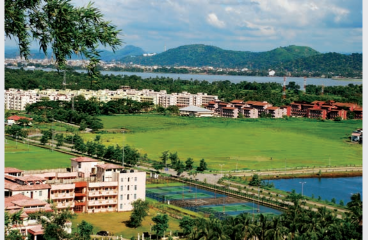
Sports fields with Girls' Hostel in the foreground and Boys' Hostels in the background