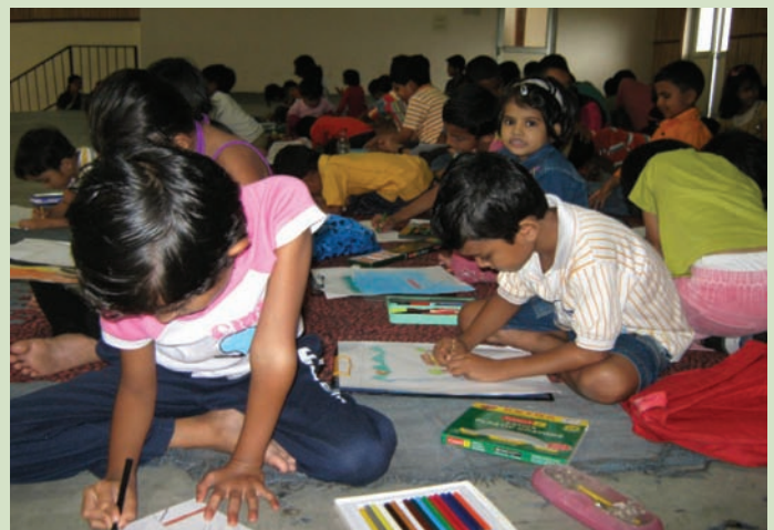
Campus children participating in the painting competition