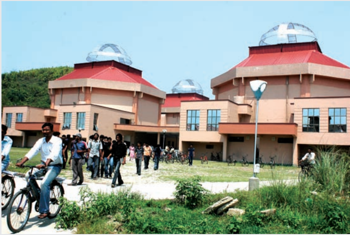
Students coming out of the Lecture Hall Complex of IIT Guwahati