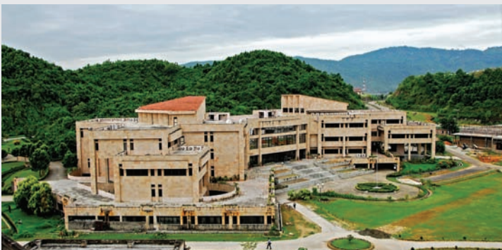
The Administrative Building