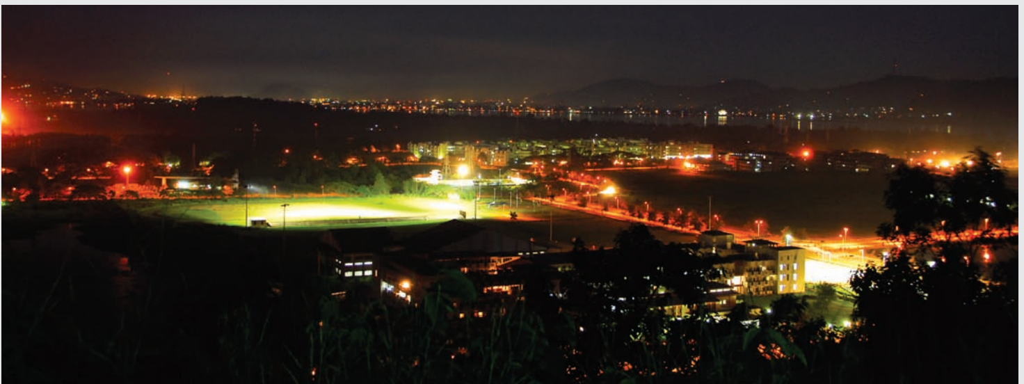
Night view of IIT Guwahati