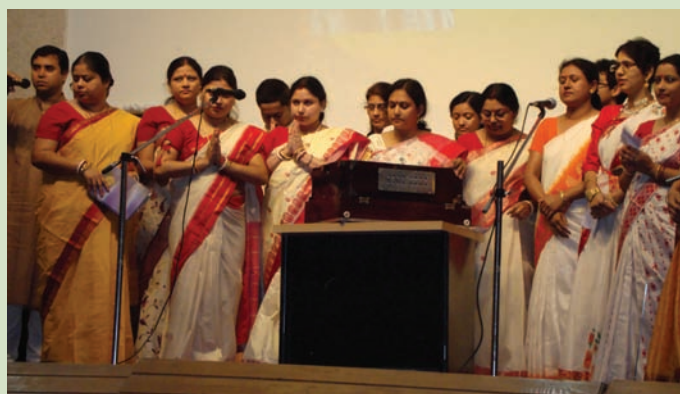
Campus residents performing during Rabindra Jayanti celebration

The 150th Birth anniversary of Rabindra Nath Tagore, the first Nobel laureate of India in literature was celebrated by the IIT Club on 15 May 2010. Members of the IITG fraternity participated in the function. The cultural programme included dance performances by a group of campus children based on Rabindra Sangeet, chorus, recitation of poems penned by the maestro and rendition of a few Rabindra Sangeet.