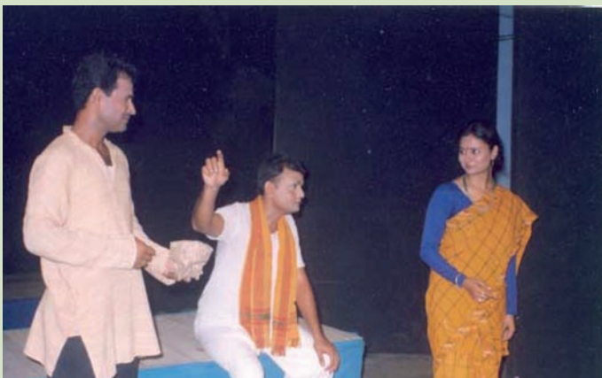
A scene from the play 'Bishnu Rabha'

IIT Club, IIT Guwahati organised a play based on his life titled 'Bishnu Rabha' on 19 June 2010 to commemorate his 41st death anniversary. A cultural evening based on his works was organised the following day in the campus by the Rongali Bihu Celebration Committee 2010, IIT Guwahati.