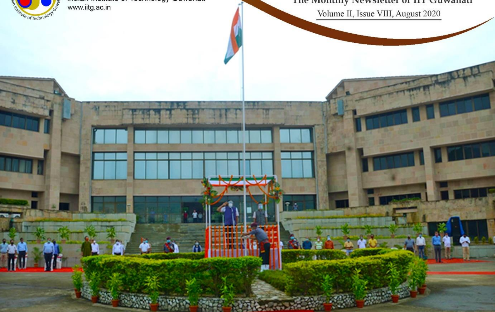
74th Independence Day celebration at IIT Guwahati