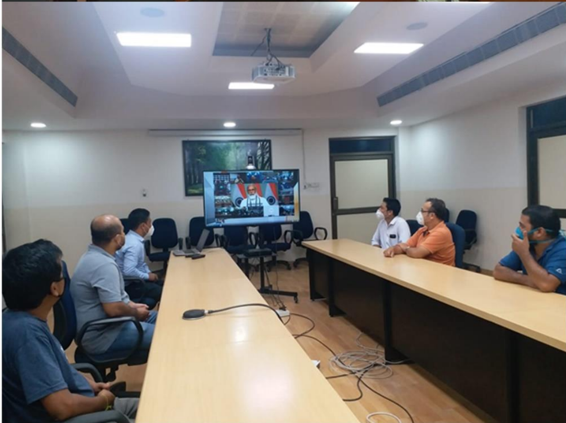
Inauguration Session of NEP Conclave on Transformational Reforms in Higher Education under National Education Policy 2020