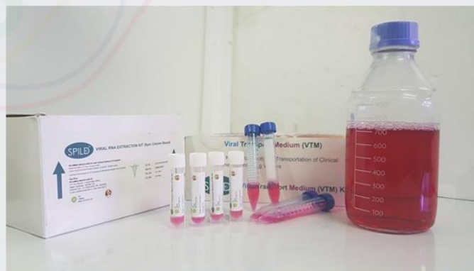
Indigenously developed COVID-19 diagnostic kits

IIT Guwahati has now been manufacturing large quantities of "SPILD" VTM kits, "SPILD" RNA extraction kits and "SPILD" RT-PCR kits jointly with RR Animal Healthcare Ltd. at the Institute, and these kits are indispensable to confirm the presence or absence of COVID-19, which until now were being imported. The Institute is ready to work with Government of India, National Health Missions as well as Hospitals and testing centers across the country for the large scale production and supply of all these kits to meet their immediate requirement.