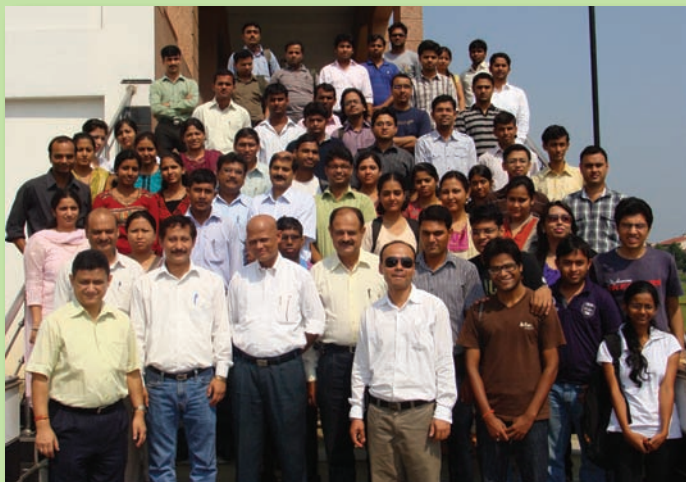
Participants of the workshop on Cancer Biology