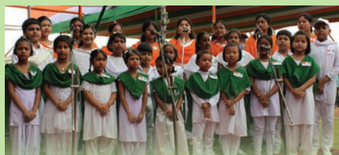
Campus children performing patriotic songs