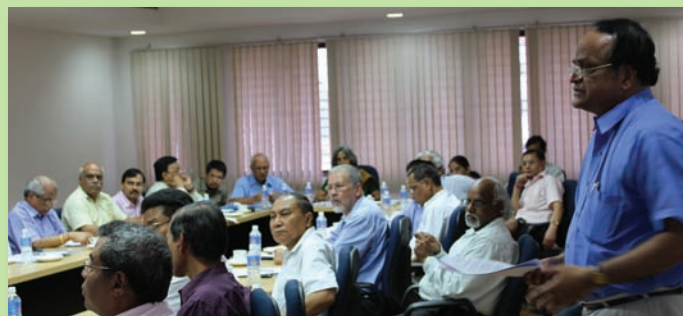
Academicians and administrators present in the meeting.

During the 11th Five Year Plan, 15 new Central Universities have been established in each State which did not have a Central University, except Goa. Eight new Indian Institutes of Technology, seven new Indian Institutes of Management, five new Indian Institutes of Science Education and Research, two new Schools of Planning and Architecture, ten new National Institutes of Technology have been established in various places across the country under this Plan. Elaborate discussions were held and numerous suggestions were made on the formulation of the 12th Five Year Plan (2012-2017) in Higher Education sector.