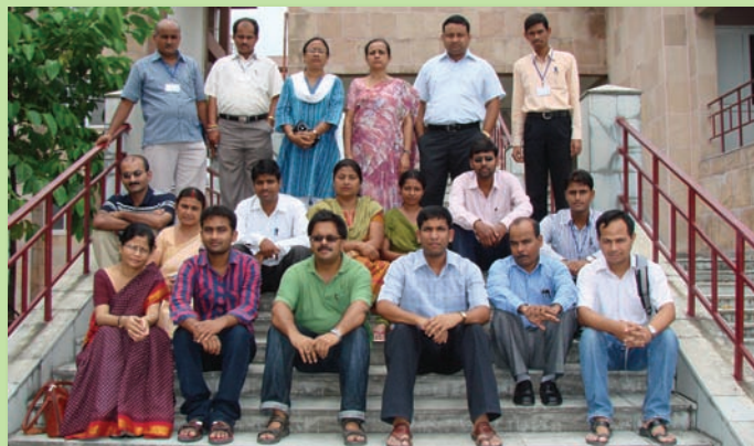
Participants of STC on Computational Techniques in Physics

IIT Guwahati regularly organises QIP-Short Term Courses with an aim of upgrading the expertise, qualification and capabilities of the teachers of degree level technical institutions. The courses are sponsored by AICTE, MHRD. The following are the courses organised during July-September 2011: