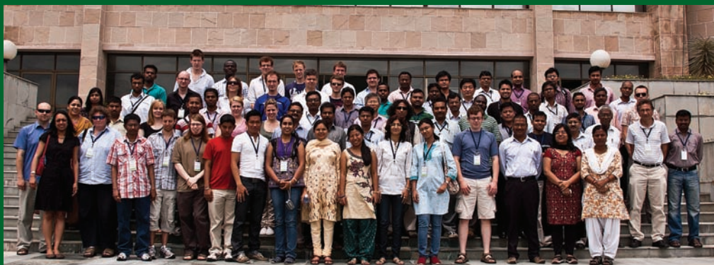
Participants of the summer school

A Summer School on Efficient Fossil Energy Technologies was organised during 4-10 July 2011 jointly by Centre for Energy, IIT Guwahati and the University of Nottingham, UK. A group of thirty research students and teachers from University of Loughborough, the University of Nottingham and the University of Birmingham participated in the summer school and shared their views in the areas of fossil fuel technologies. Twenty seven research scholars from various Indian institutes, universities also participated in the school. Two professors from Pusan University, Korea and technical expert from Alhtom, Jadavpur University attended the summer school and delivered lectures. Faculty members associated with the Centre for Energy and from other departments of the Institute took part and delivered lectures in the summer school.