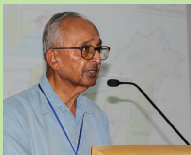
Mr. B. G. Verghese