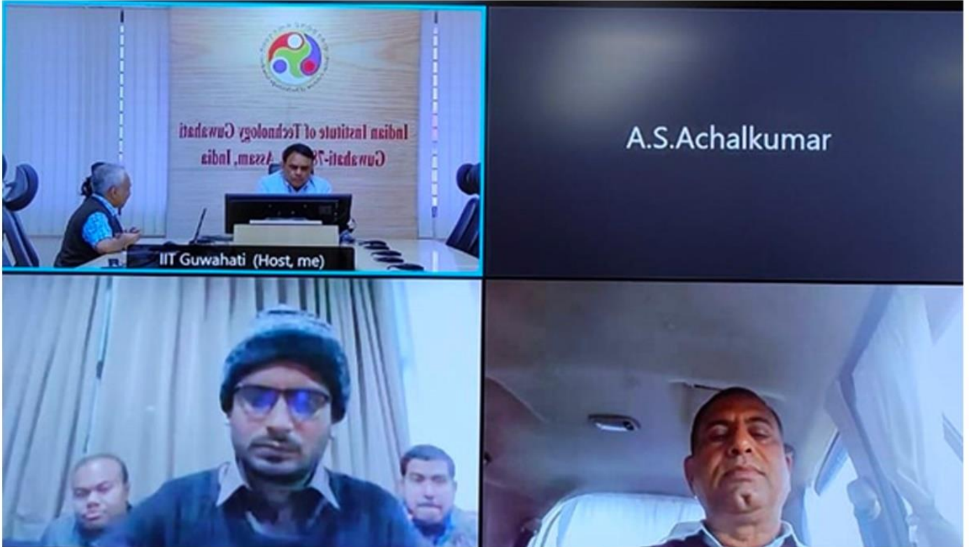
IIT Guwahati signed MoU with NIT Sikkim.