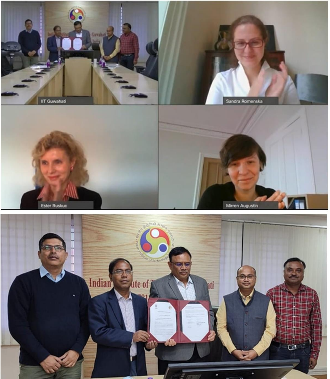
IIT Guwahati signed MoU with University of St. Andrews