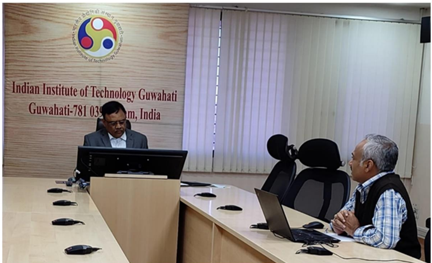
IIT Guwahati signed MoU with National Institute of Technical Teachers' Training & Research (NITTTR), Kolkata.