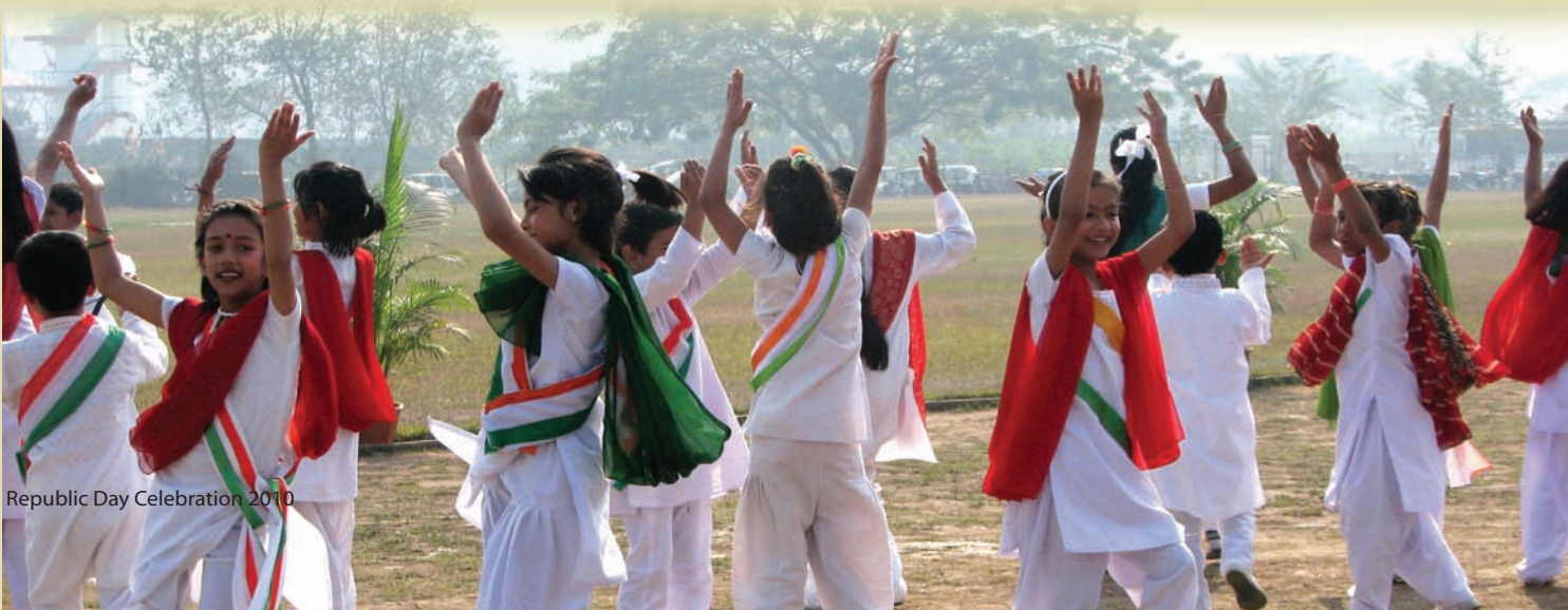
Republic Day Celebration 2010