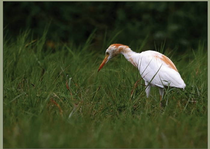
Cattle Egret ( Bubulcus ibis )