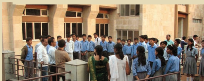
A visit by the students of Ambikagiri Ray Choudhury Jatiya Vidyalaya, Sonitpur on 12 March 2010