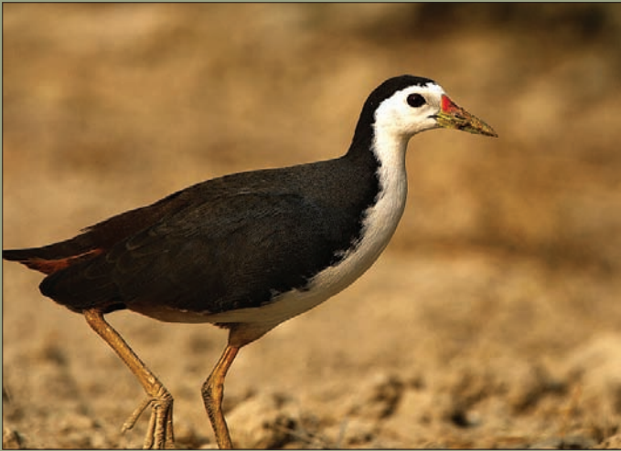
White-breasted Waterhen ( Amaurornis phoenicurus )

Pictured below are a few seasonal residents of the Institute