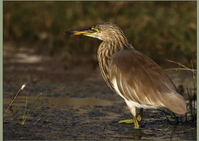
Indian Pond Heron ( Ardeola grayii )