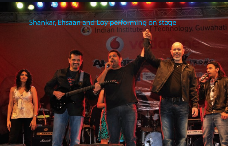
Shankar, Ehsaan and Loy performing on stage

ALCHERINGA, meaning dream time in the Australian tongue, is the annual cultural fest of Indian Institute of Technology Guwahati and is the biggest cultural extravaganza in the north east. ALCHERINGA 2010 was held in the month of February and various colleges from across the country headed to Guwahati to be a part of this fest. Heading the list of the most awaited events was the proshows which included a performance by the music 'gurus', the triumvirate of Shankar, Ehsaan and Loy, who have the country grooving to their beats. The rock night 'Juggernaut' had Eluveitie, the Swiss metal band,