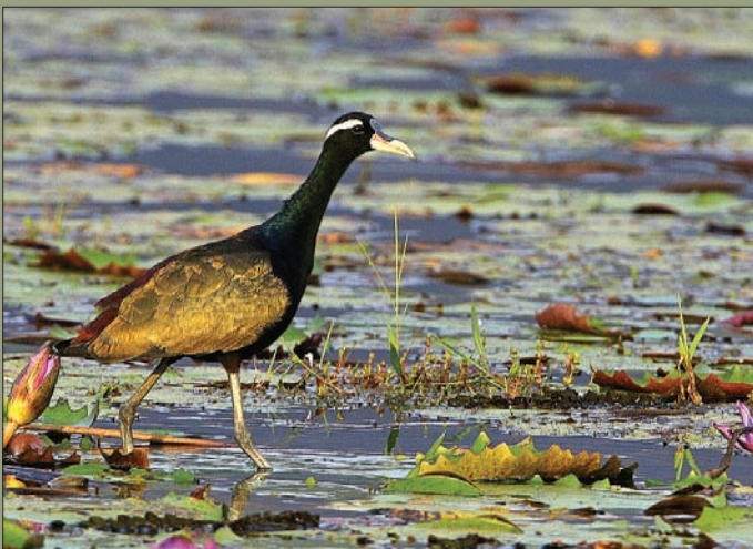
Bronze-winged Jacana ( Metopidius indicus )