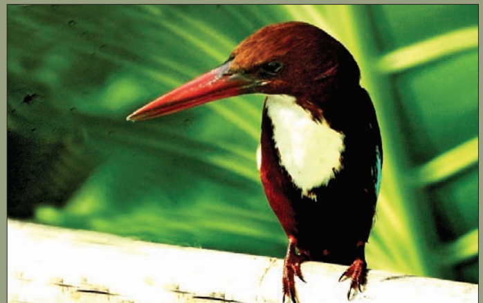
White-throated Kingfisher ( Halcyon smyrnensis )