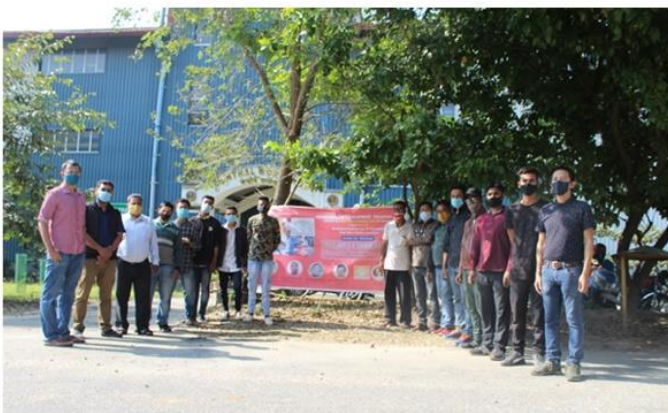
IITG UBA Participants