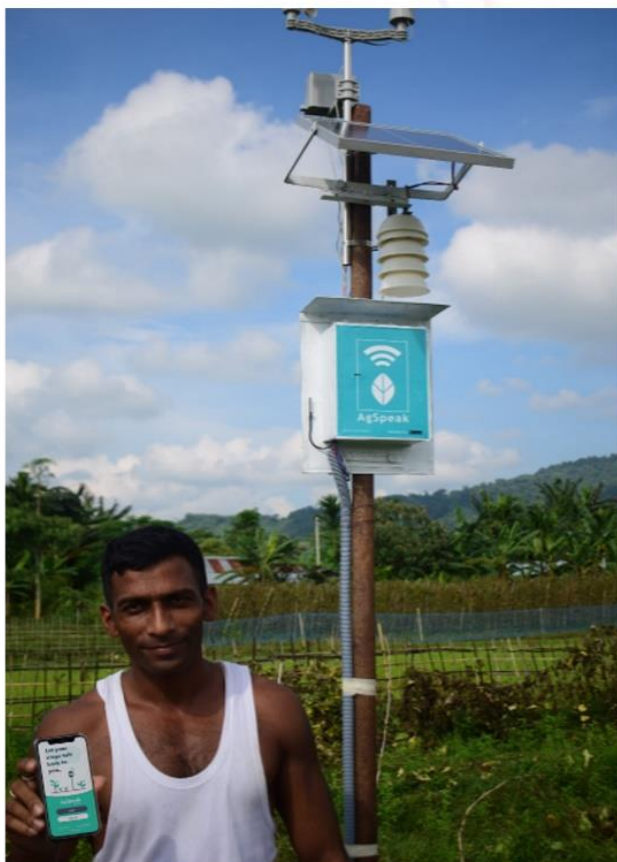
Farmer using AgSpeak