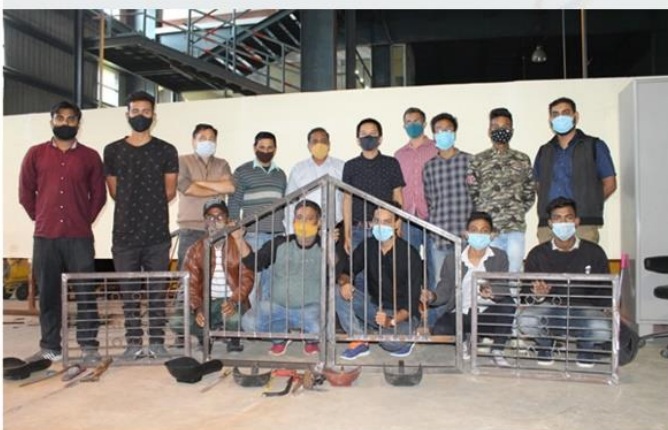
IITG UBA Participants with Grill

Unnat Bharat Abhiyan is inspired by the vision of transformational change in rural development processes by leveraging knowledge institutions to help build the architecture of an Inclusive India. The Mission of Unnat Bharat Abhiyan is to enable higher educational institutions to work with the people of rural India in identifying development challenges and evolving appropriate solutions for accelerating sustainable growth.